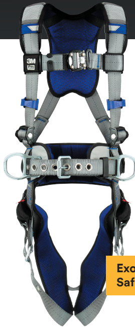
ExoFit™ X200 Safety Harness