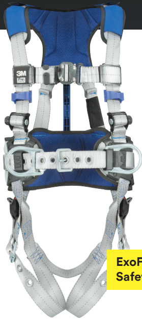
ExoFit™ X100 Safety Harness