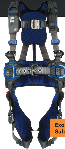
ExoFit™ X300 Safety Harness